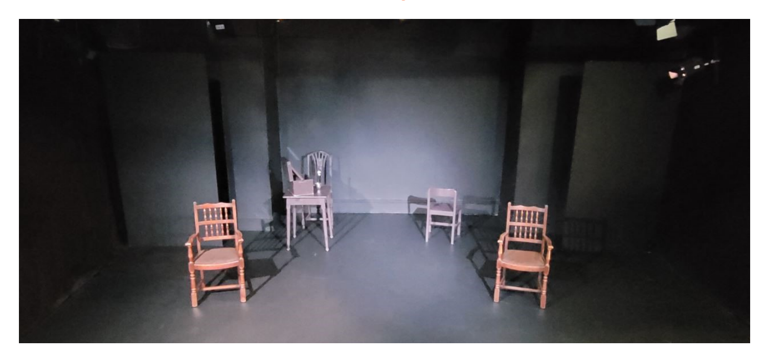
The set for Macready! Dickens' Theatrical Friend